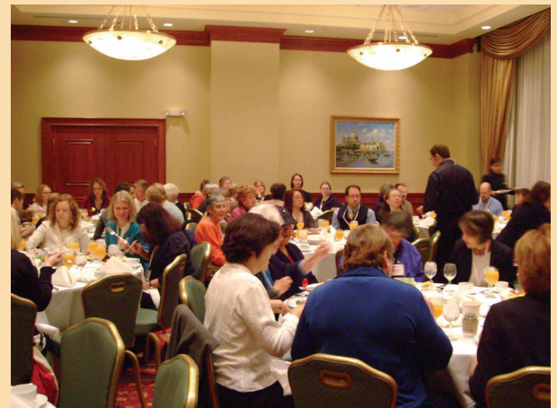
Attendees at the 25th Anniversary CWWH Breakfast.

We currently have more mentors than mentees.