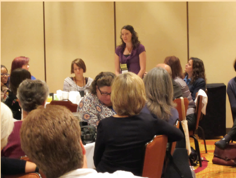
From the 2011 breakfast in Oakland.

For those not familiar with the history of the GSMF, in 2008 the CWWH approached the WHA Council about creating the Graduate Student Meal Fund for the first time. The Council tabled the proposal because of concerns about its administration. In the spring of 2009, the CWWH went before the Council a second time. Again, concerns about its administration were raised. CWWH agreed to administer the program in an effort to get it off the ground. The idea was that once CWWH demonstrated the viability of the program, the WHA would take over its administration. For the 2012 conference, the CWWH will once again administer this worthwhile WHA program. Thanks CWWH members for being such wonderful supporters of the GSMF. Editor