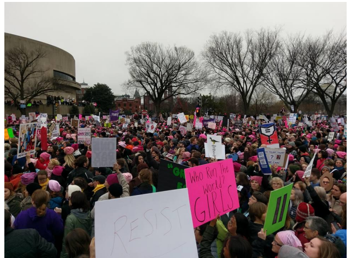
Washington D.C.

I am still held by the strength of all those determined folks—not denying the very real challenges we confront, yet daring, in President Obama's words, to "Hold firmly, without wavering, to the hopes that we profess."