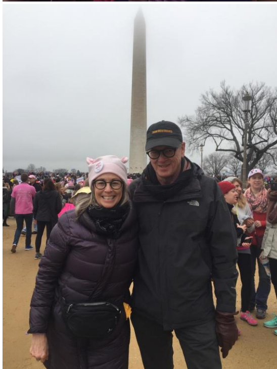
Washington D.C., and "Pink Plane"